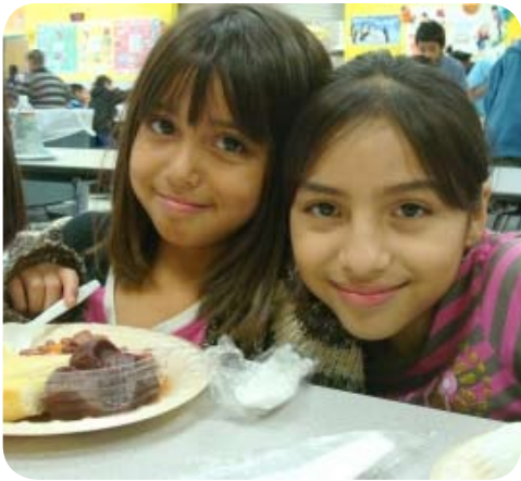
(Capital Food Bank of Texas)

Food insecurity has negative consequences on physical and mental health; it can also be socially isolating. People who are food insecure are less able to afford healthy and more expensive foods, like fruits and vegetables, dairy and meat products, and whole-grain products. Children and adults that experience hunger or are not eating a well-balanced diet are more likely to suffer poor health – including stomach aches and headaches, iron deficiency, obesity, and many other health problems. Food insecurity is also related to an increased likelihood of obesity, which can lead to many medical risks and complications, as well as a decreased quality of life. Food insecurity is also associated with increased stress, anxiety and depression.