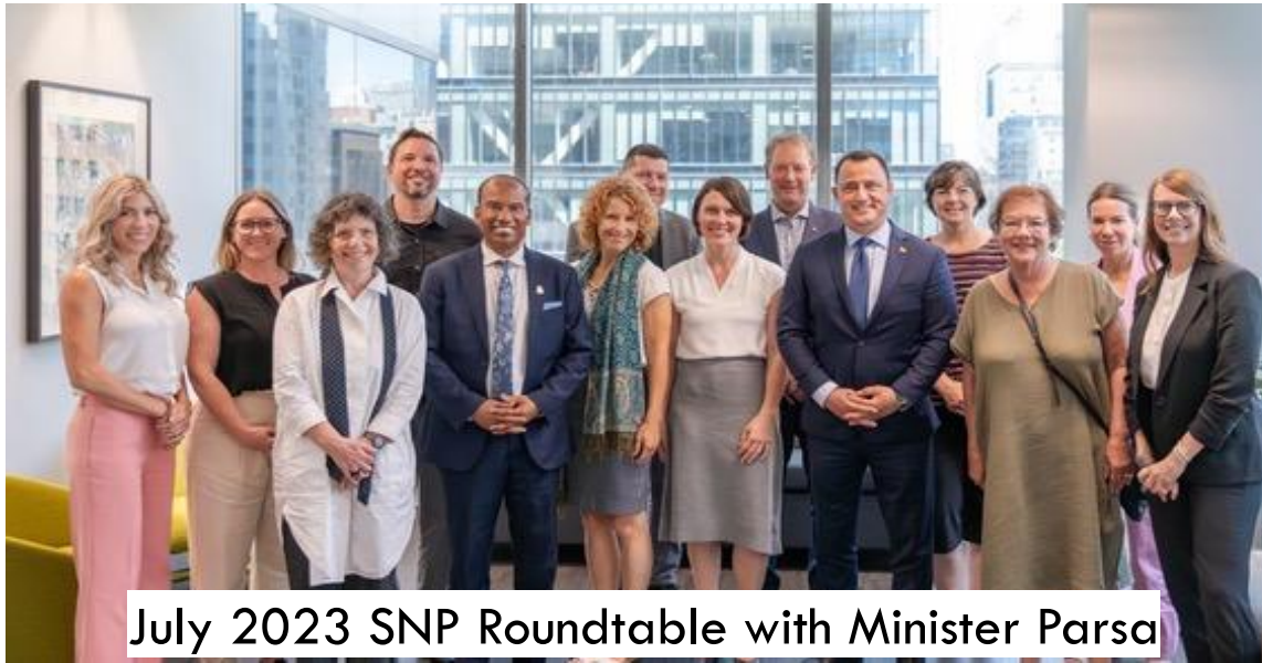
July 2023 SNP Roundtable with Minister Parsa