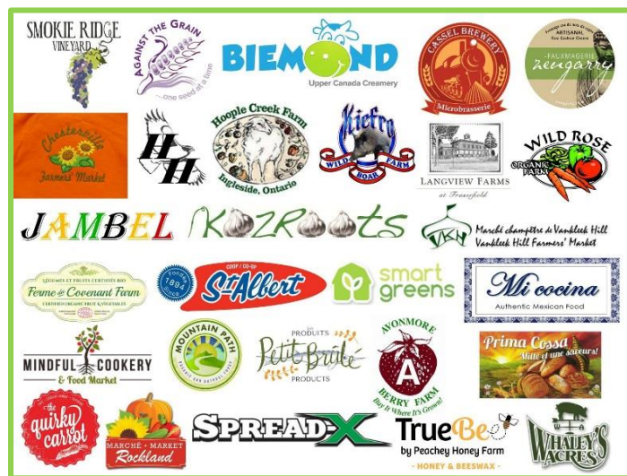
Local Food Challenge food service partners and producers.

We see the Local Food Challenge as one of many steps needed to combat challenges of food de-skilling and illiteracy, decreasing local agriculture sales, financial and geographical food accessibility, and unhealthy community engagement.